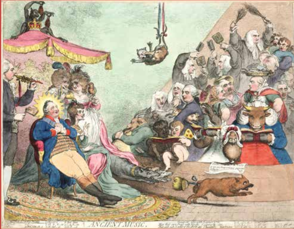
James Gillray, Ancient Music , 1787