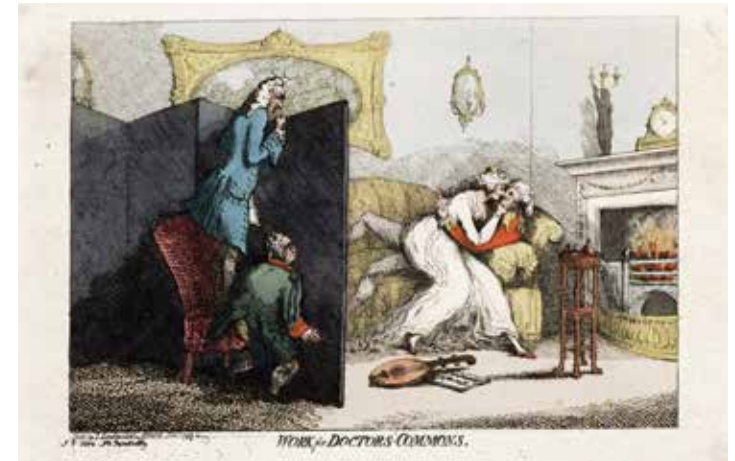
Thomas Rowlandson, Work for Doctors' Commons , 1792

In addition to mockery of English musical ineptitude and poor taste, satirists favored another rich theme in their depictions of English music making: the ancient association of music with romantic desire. One source of anxiety about music was its tendency to titillate – its potential to act as a powerful aphrodisiac even for virtuous gentlemen and ladies. It is not unusual to find musical instruments in eighteenth-century satires of illicit encounters, as in Thomas Rowlandson’s depiction of members of the