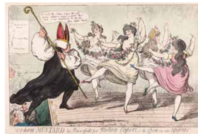
Isaac Cruikshank, Durham Mustard too Powerful for Italian Capers, or, The Opera in an Uproar, 1807