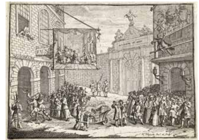
William Hogarth, Masquerades and Operas, State 2 , ca. 1724

This turn to the foreign with the introduction of Italian opera in 1705 came just a decade after the death of Henry Purcell, recognized in his own day and still admired in ours as one of the greatest English composers. His death later came to be regarded as the end of an era of English compositional prowess that had begun during Elizabeth's reign. Whereas England had previously produced composers – Tallis, Byrd, Dowland, Purcell, and many others – whose music kindled admiration on the Continent, in the eighteenth century it was believed, at home as well as abroad, that those days were over. Under these circumstances, debates over Italian opera or other “imported” music were often couched in chronological as well as national terms: “ancient” versus modern music. Over the eighteenth century the ancient-or-modern music debate eclipsed the national, and inspired numerous satires. An especially provocative example is Edward Francis Burney's Amateurs of Tye-Wig