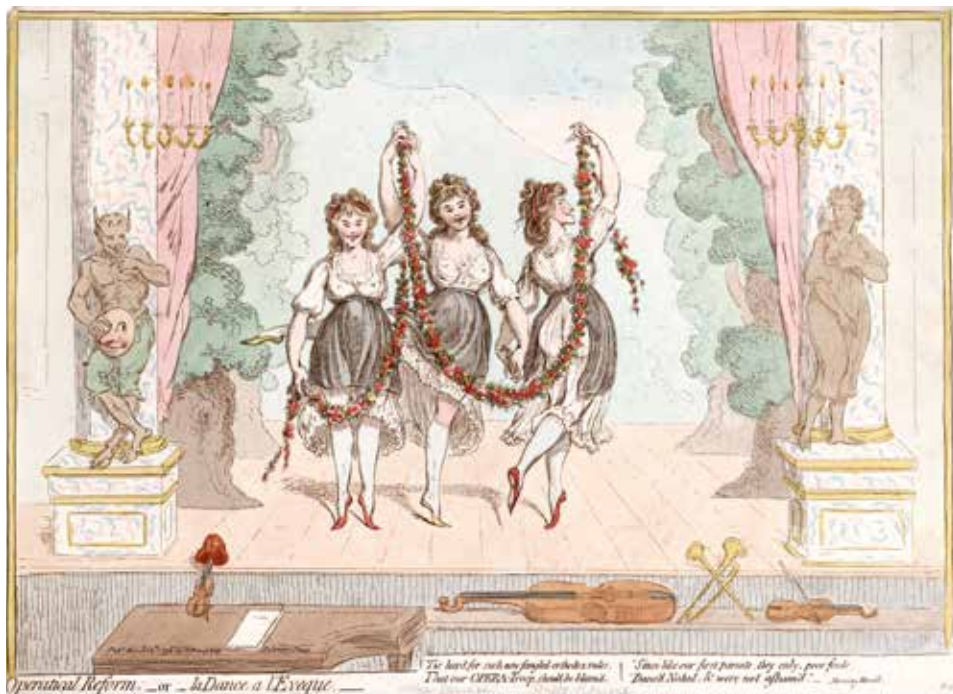
James Gillray, Operatical Reform , 1798

English, as Addison put it, had “a genius for other performances of a much higher nature, and capable of giving the mind a much nobler entertainment.” 13 By 1776 Charles Burney had naturalized Italian opera into English national identity along these lines. He insisted in his influential history of music that, lacking musical talent at home, it was “no more disgraceful to a mercantile country to import it, than wine, tea, or any other production of remote parts of the world.” 14 It was perfectly acceptable for the English to fashion themselves, light-heartedly and with little compunction, as an unmusical people — a nation of consumers of culture as well as commodities — a land of music lovers without music of their own.