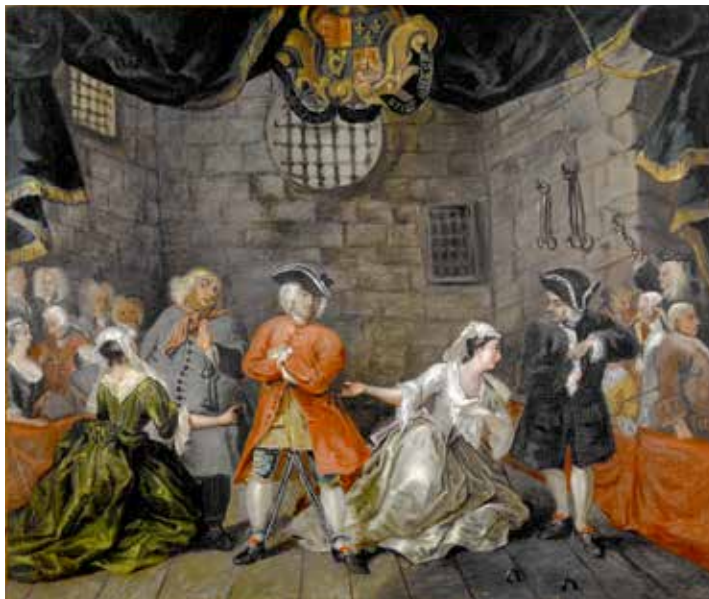
Formerly attributed to William Hogarth, Beggar's Opera, Act III , ca. 1728

This painting was not the first contribution Hogarth made to the Italian opera controversy. In 1724 he published Masquerades and Operas , which assails English audiences for their taste for the foreign. A devil and a fool lead a group of masqueraders into the Haymarket Opera House. The banner hanging above adapts another well-known Hogarth print of soprano Francesca Cuzzoni and castrati Senesino and Berenstadt performing in George Frideric Handel's opera Flavio , here with the addition of kneeling