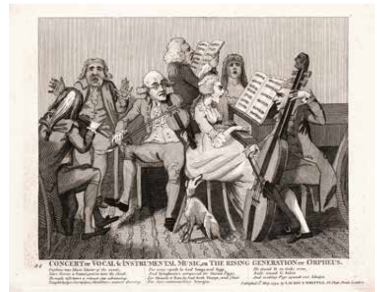
Isaac Cruikshank, Concert of Vocal & Instrumental Music, or, The Rising Generation of Orpheus , 1794