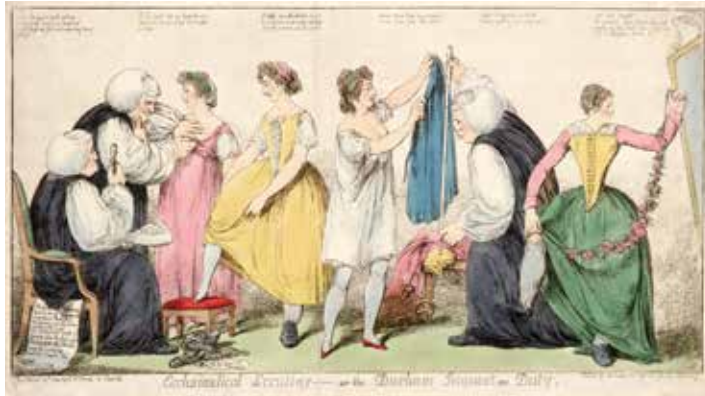
Charles Ansell, Ecclesiastical Scrutiny, or, The Durham Inquest on Duty , 1798