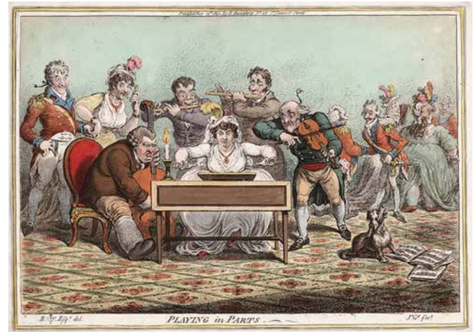
James Gillray, after anonymous artist, Playing in Parts , 1801