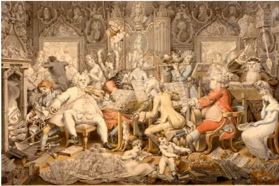
Edward Francis Burney, Amateurs of Tye-Wig Music , ca. 1800–1815

Music , which mocks advocates of “ancient” music. Dressed in fashions, including tye-wigs, that are decades out of date, these amateurs haphazardly perform Baroque music, surrounded by portraits of esteemed composers of the late sixteenth through the mid-eighteenth centuries – Bull, Gibbons, Locke, Purcell, and Handel, among others. Scores by the “modern” composers Beethoven, Mozart, and Haydn warm the musicians from the fire grate.