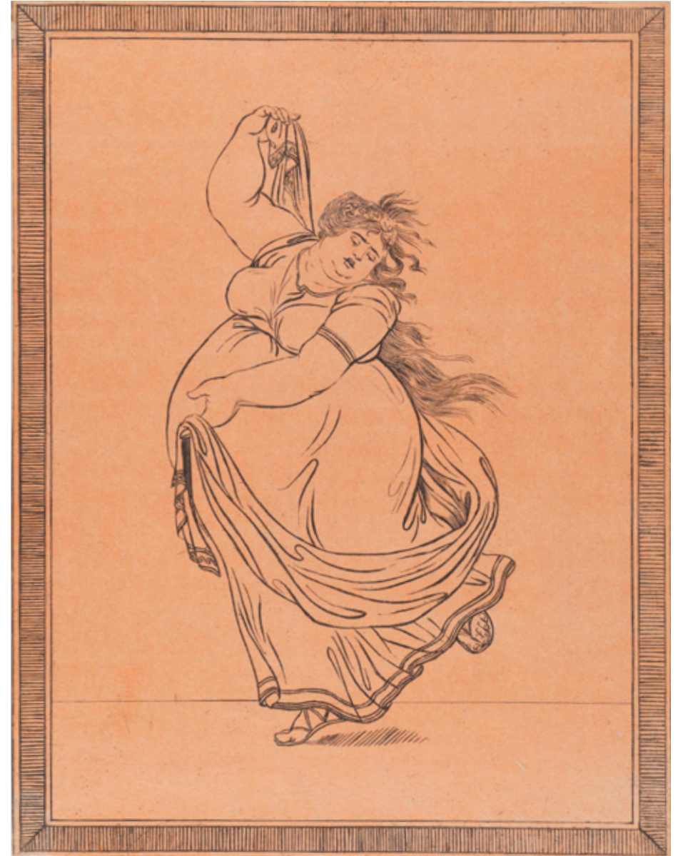
Plate VI from James Gillray, A New Edition Considerably enlarged of Attitudes Faithfully copied from Nature...

Emma Hamilton performed all the time. Her deportment, dancing, and Attitudes, as everyone who wrote about her mentioned, were remarkable. There were some who admired her bearing and saw antiquity in it. “In her,” wrote Goethe, Sir William had “found all the antiquities, all the profiles of Sicilian coins, even the Apollo Belvedere.” Others derided her and were offended by her presence, especially later in her life when her figure changed. “Her person is nothing short of monstrous for its enormity, and is growing every day.” In response to that increase in size, James Gillray produced A New Edition Considerably enlarged of Attitudes Faithfully copied from Nature and Humbly Dedicated to all admirers of the Grand and Sublime in 1807. For the first time, this 1807 “enlarged” edition of the