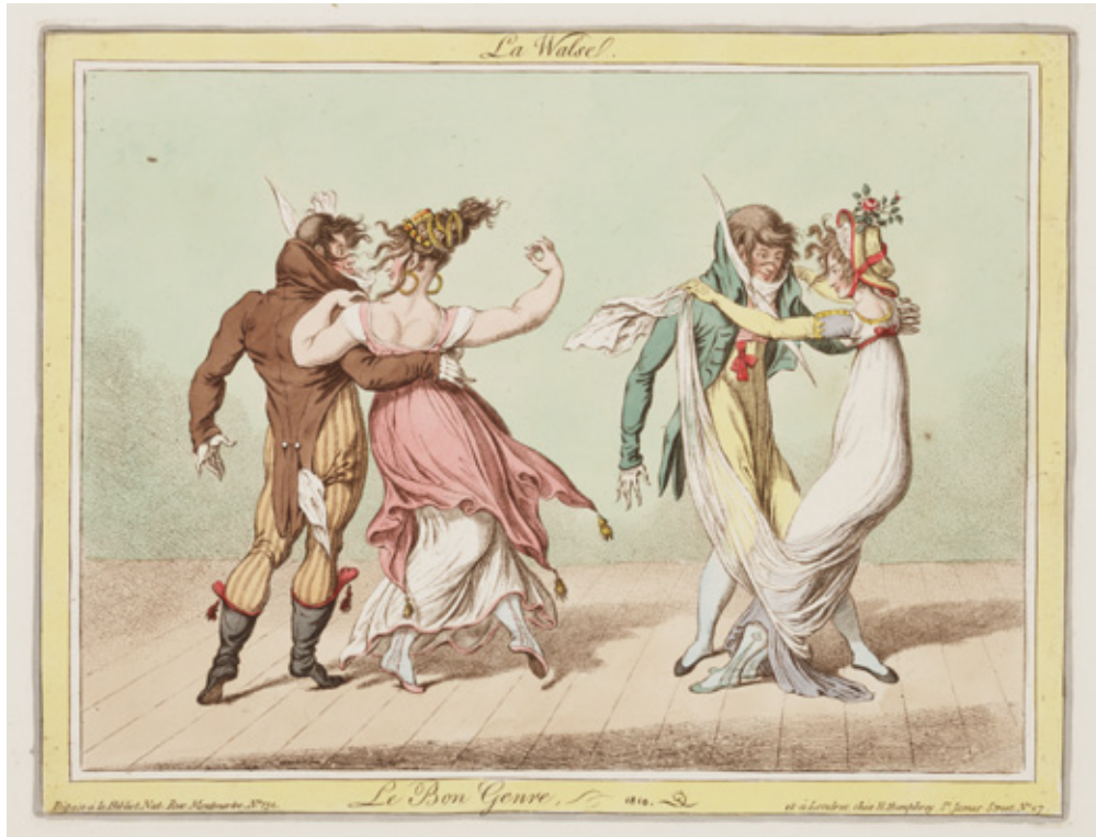
James Gillray, La Walse. Le Bon Genre