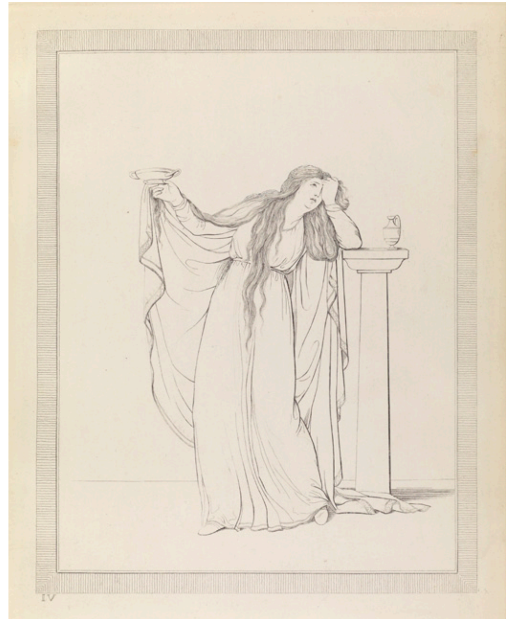
Plate IV from Frederick [Friedrich] Rehberg, Drawings Faithfully copied from Nature at Naples (Rome, 1794)

On this night in London in 1801 Emma Hamilton was thirty-five. She was married to an aristocratic former ambassador and art collector, and she was the mistress of a glorious naval commander. Eighteen years previous, in 1783, she had been trafficked from England, where she had been kept by Charles Francis Greville, to Naples, where she married Greville’s uncle, the widower Sir William Hamilton. Her victory tarantella was performed seven years after the publication of engravings showing the series of expressive postures that came to be known as Hamilton’s “Attitudes.” And it was six years before the publication in 1807 of a new, satirical version of these Attitudes showing her drastically enlarged; two years before the death of her husband; four years before Nelson’s death at the Battle of Trafalgar; and fourteen years before her own obscure, penurious death in Calais, aged forty-nine.