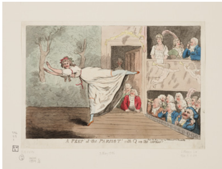
Isaac Cruikshank, A Peep at the Parisot with Q in the corner!