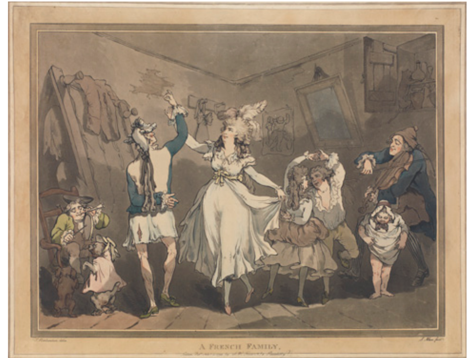
Samuel Alken after Thomas Rowlandson, A French Family