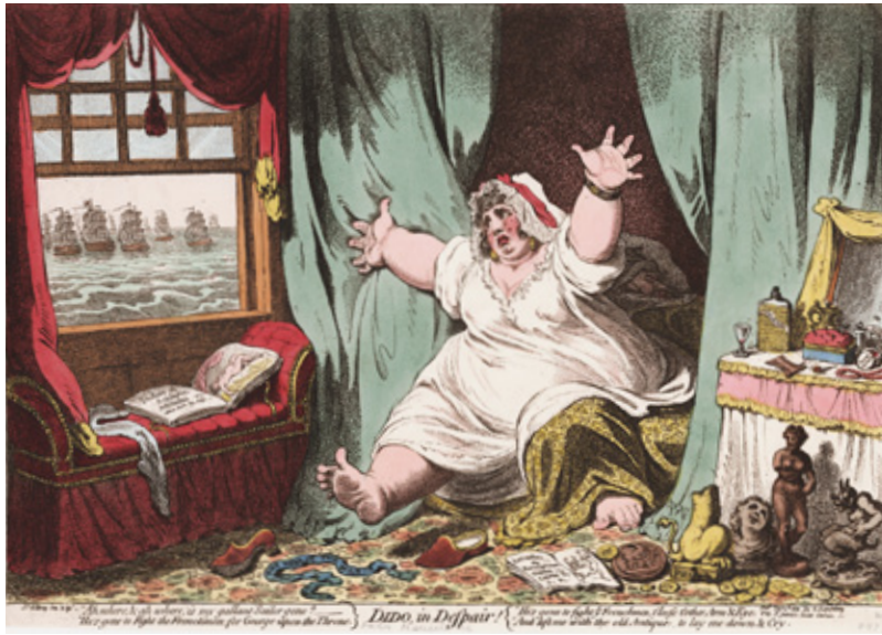
James Gillray, Dido in Despair!

After the death of Nelson in 1805 at the Battle of Trafalgar, Emma Hamilton was denied maintenance by the state, quickly exhausted the income left her by Sir William, and fell heavily into debt and alcoholism. She escaped her London creditors and fled for Calais with her only daughter, by Nelson, Horatia. If she struck attitudes after 1805, they are not recorded. She died in 1815.