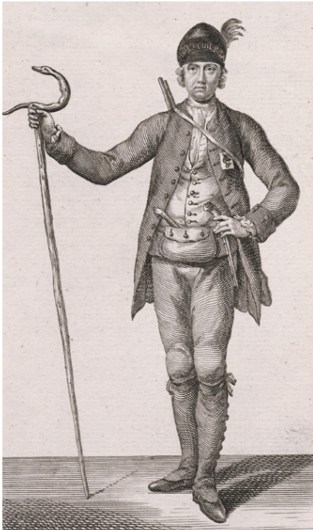
John Miller (1715–1790) after Samuel Wale (d. 1786), James Boswell, Esqr. in the Dress of an Armed Corsican Chief . Etching with stipple and engraving, published 1769. 769.09.00.03

“I am indulging the most agreeable reveries imaginable, I am thinking of . . . composing some elegant Work which shall be much read, and much admired. I am thinking of the brilliant Scenes of happiness that I shall enjoy in the Guards, How I shall be acquainted with the Grandeur and Politeness of a Court, be entertained with all the elegance of dress and Diversions, become a favourite of Ministers of State, and the adoration of Ladies of Quality, Beauty & Fortune. How many parties of Pleasure shall I have in Town! How many fine jaunts to the noble Seats of Dukes, Lords and members of Parliament. I am thinking of the perfect knowledge that I shall acquire of men and manners, of the many ingenious and learned Men whose Intimacy I shall be honoured with, Of the many literary amusing Anecdotes which I shall pick up, and of the magnificent Letters which I shall write to You.”