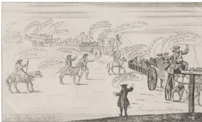
ABOVE George Townshend (1724–1807), We are all a Coming, or, Scotch Coal for ever . Etching, published 1761. 761.00.00.05+ Impression 1